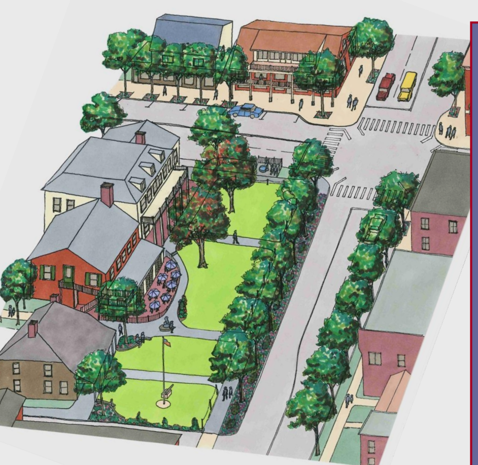
Rhinebeck's re-imagined Village Green

Other recommended improvements for the Village Center include shorter crosswalks at the main intersections and diagonal parking along the south side of West Market Street to expand commercial parking options and slow traffic on this overly wide street. Extended sidewalks into the parking lanes at central crosswalks would have multiple benefits, such as shorter safer crossing distances, extra areas for landscaping, the prevention of illegal parking too close to corners, and better pedestrian and vehicle visibility.